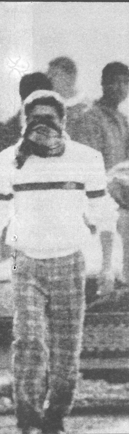
Confronting the occupation