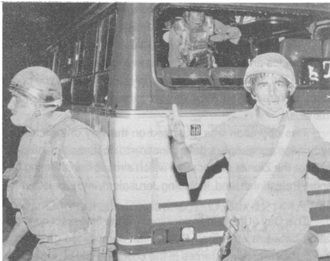
Israeli repressive forces in panic