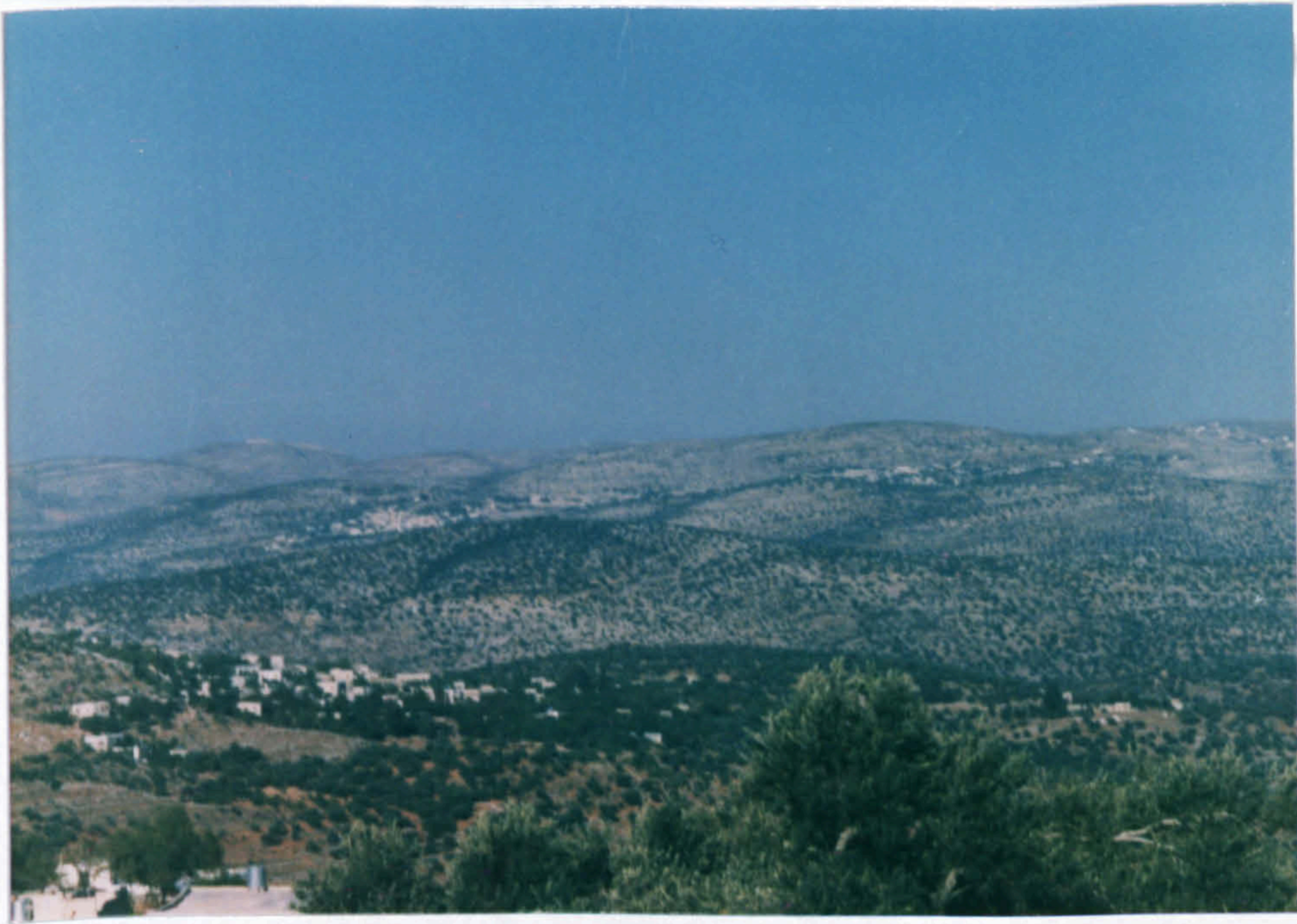
Fig. 3.1: Agricultural fields separate the villages' built-up areas.