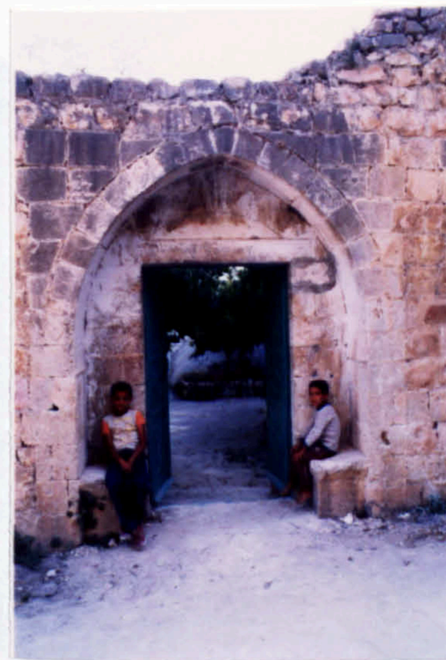
The Atrash Compound